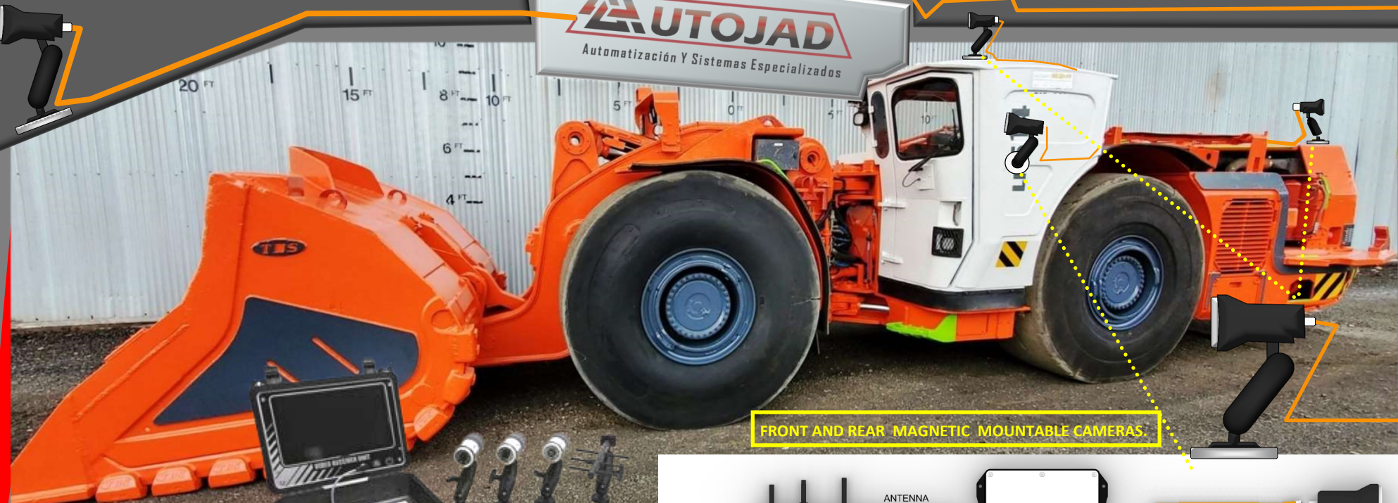
FRONT AND REAR MAGNETIC MOUNTABLE CAMERAS.